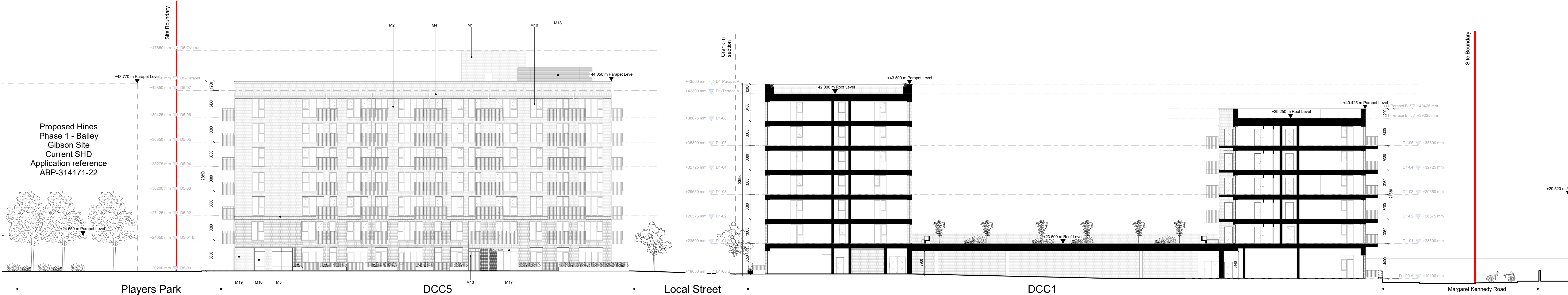
Site Section 4 1:200